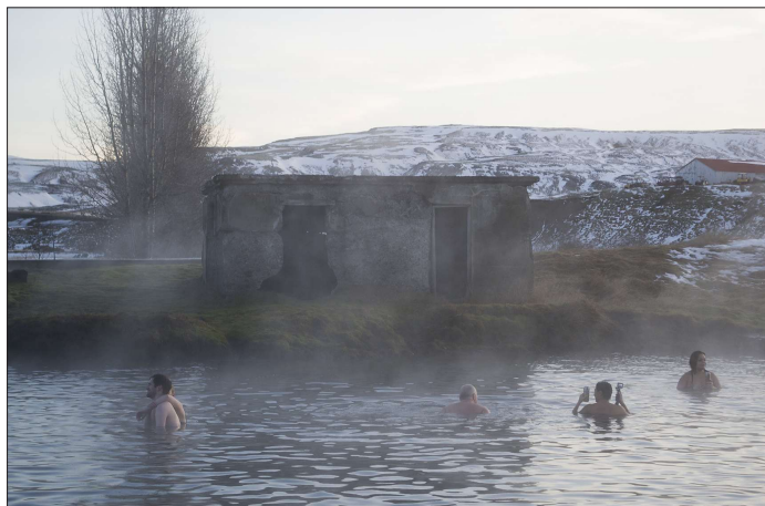
The Secret Lagoon.