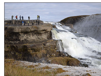
The Golden Falls.