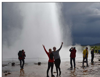
Strokkur at Haukadalur.