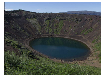
Kerid eruption crater.