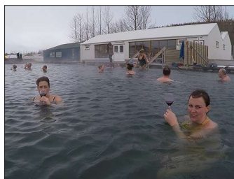
The Secret Lagoon.