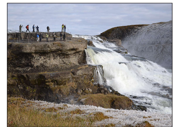
The Golden Falls.