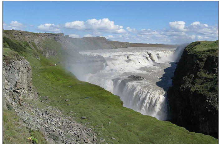
The Golden Falls.