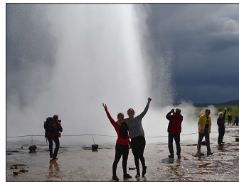
Strokkur at Haukadalur.