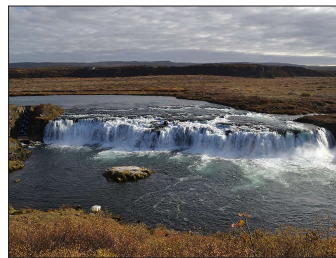
Faxi water fall.