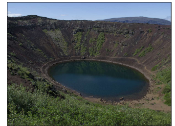
Kerid eruption crater.