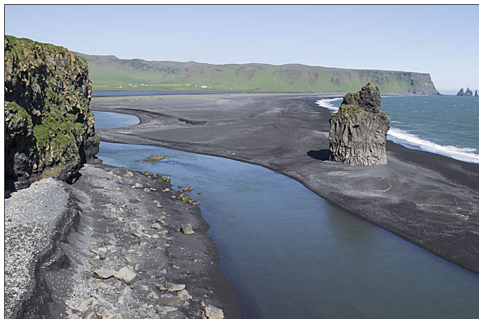
The South Coast, black beaches and bird cliffs.