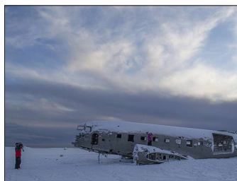
DC-3 airplane on the black beach.