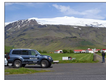
Eyjafjallajokull volcano glacier sights.