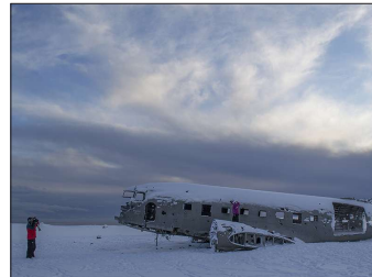
DC-3 airplane on the black beach.