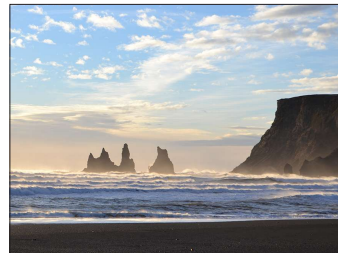
The South Coast black beach.