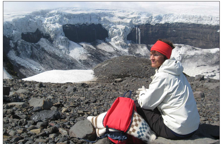
Rjúpnagilsbrúnnir, close to volcano Katla.

We do not offer this tour from Reykjavik due to long driving.