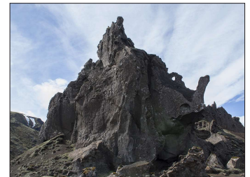
On the way to Thakgil.