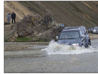
River crossing near Landmannalaugar