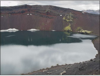
Liótipollur eruption crater