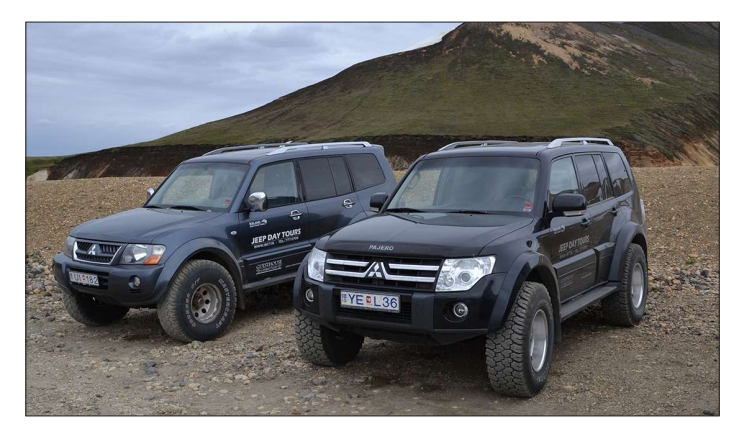
The vehicles are comfortable and well equipped where the driver is also the guide (driver guide). We recommend group sizes of 2 - 5 persons per tour.