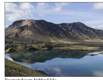
Frostastaðavatn highland lake